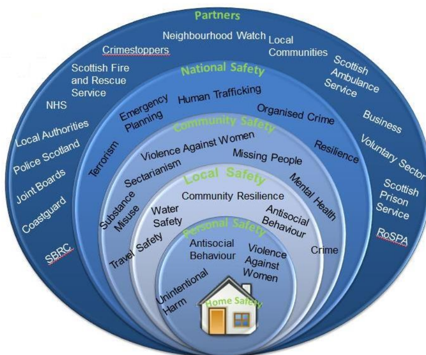
Diagram 1 – Community Safety Target Diagram

It is clear that there are many contributing factors and interdependencies that make a community safe cover a very broad and varying range of policy areas. Following the Commission on the Future Delivery of Public Services, 2011 11 (Christie Commission), there has been significant reform, legislative and policy changes that have impacted on the way community safety services are delivered. A number of key reforms are outlined in Table 3 .